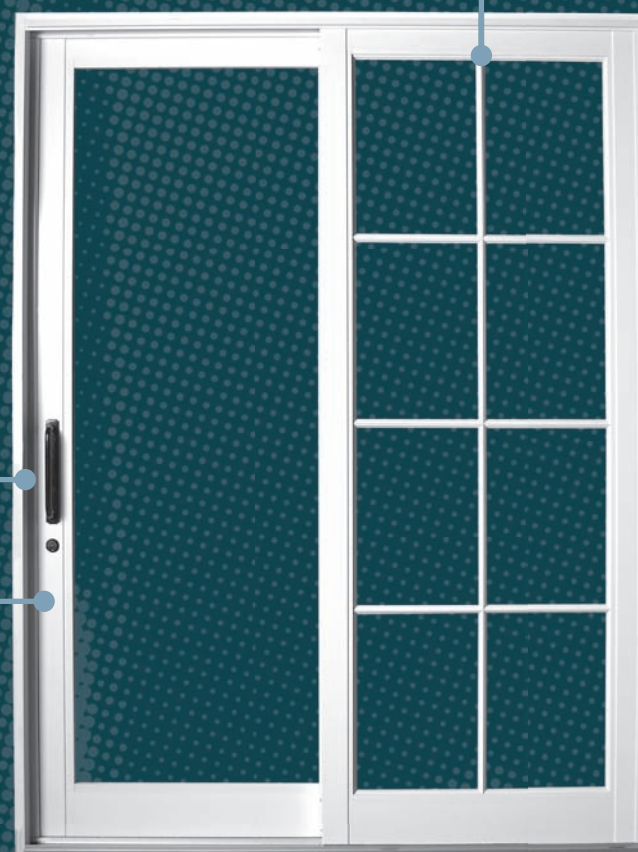
Above door shows optional contemporary square glazing bead on the left panel and standard Ogee contoured glazing beads and muntins on the right.

CGI's Series 560 Sliding Glass Door maintains similar sightlines to the Series 450 French Doors. CGI's SGD includes standard features not found in competitive products, such as MS S/S deadbolt hook lock, cast S/S keeper, tandem S/S rollers with precision bearings and an easy to install frame without complex trims or covers, providing an over-all clean design. Available in panel sizes up to 5' x 10', design pressures of -170 PSF, water resistance options of 9 to 18 PSF, and two, three and four panel configurations.